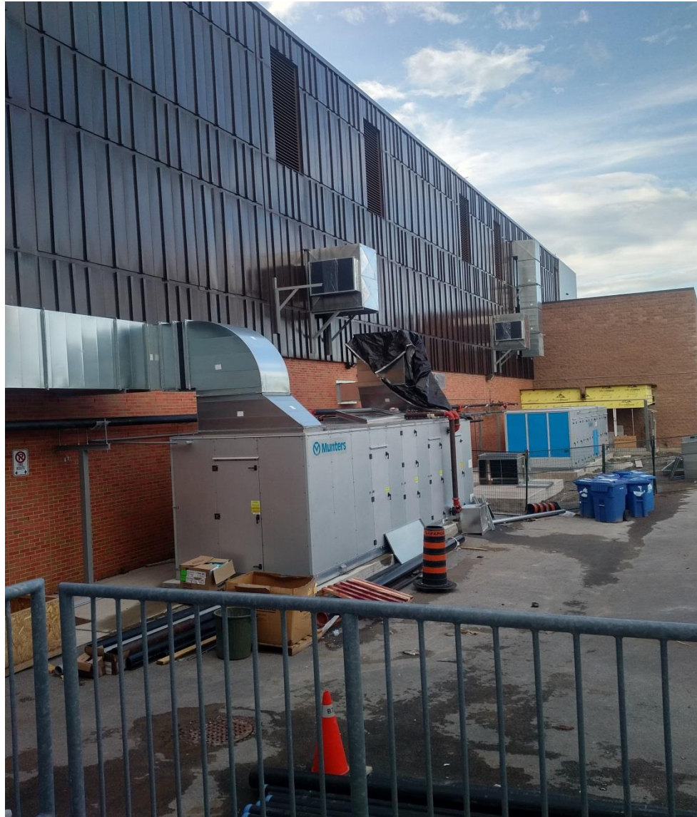
New mechanical dehumidification and air handling systems – AHL standards