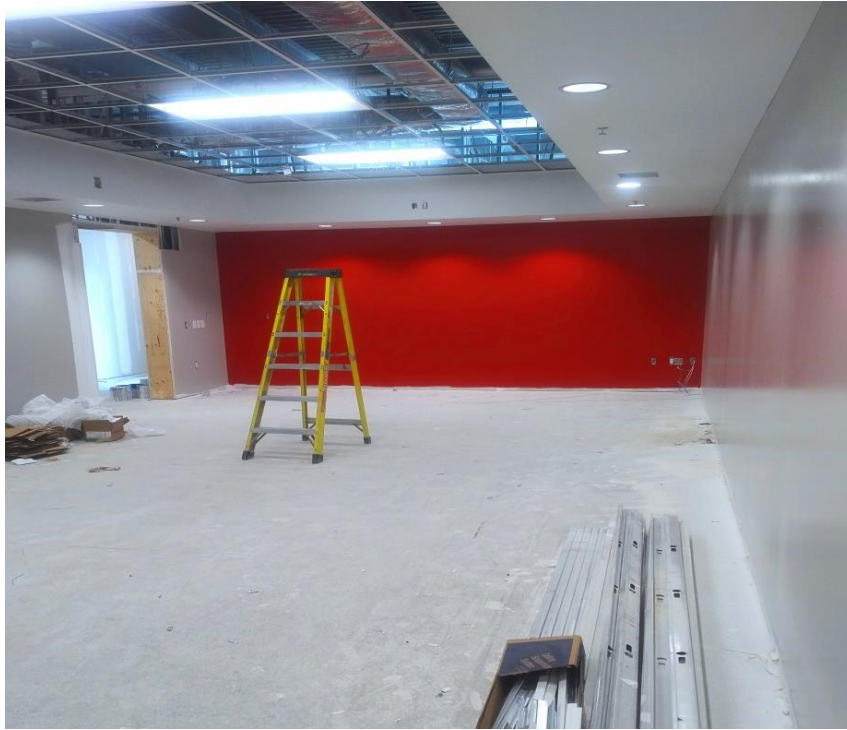
Players' main dressing room – ready for flooring, furniture and doors