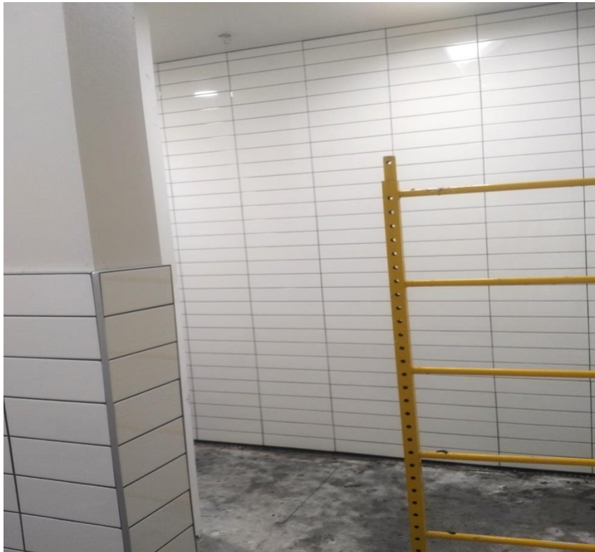
Showers ready for final tile flooring and fixtures